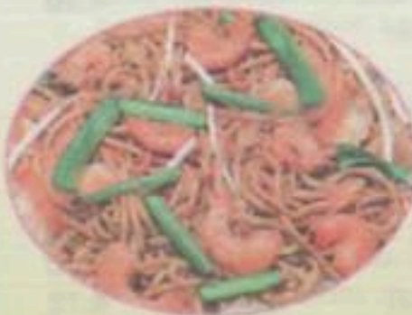
Shrimp Lo Mein