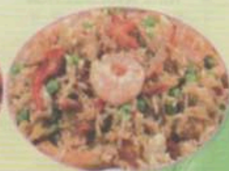
House Special Fried Rice