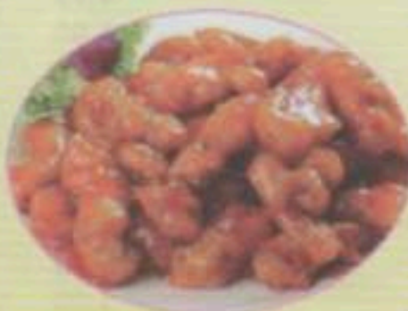
General Tso's Chicken