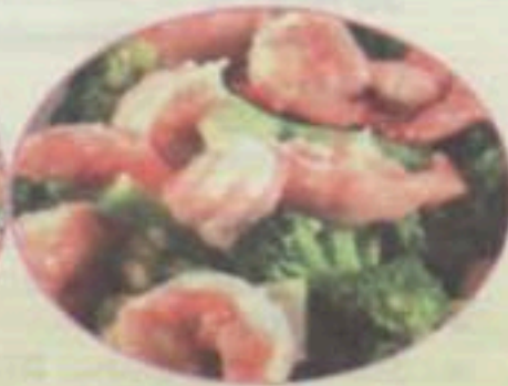
Shrimp w. Broccoli